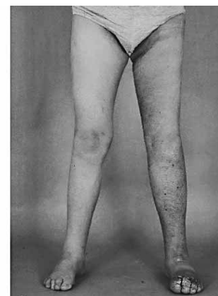
Fig. 2 - Primary lymphoedema before (14 300 ml) and after liposuction.